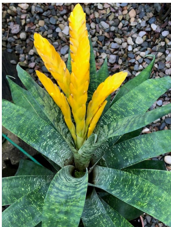
Goudaea ospinae 'Gruberi' - (left)

Here is a teaser for the February meeting. These photos have been submitted by our members represent some of the highlights of this past year's growing season!