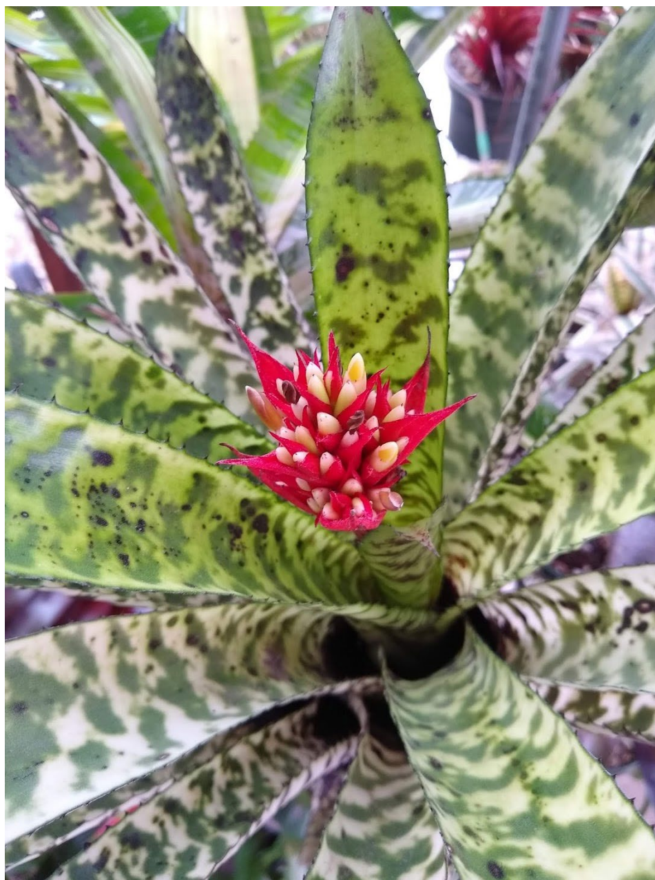
Aechmea orlandiana 'White Knight'. Fascinating foliage provides year-round interest, while the blooms appear during mid-winter's shortest days!

The Southeast Michigan Bromeliad Society An Affiliate of the Bromeliad Society International January/February 2023