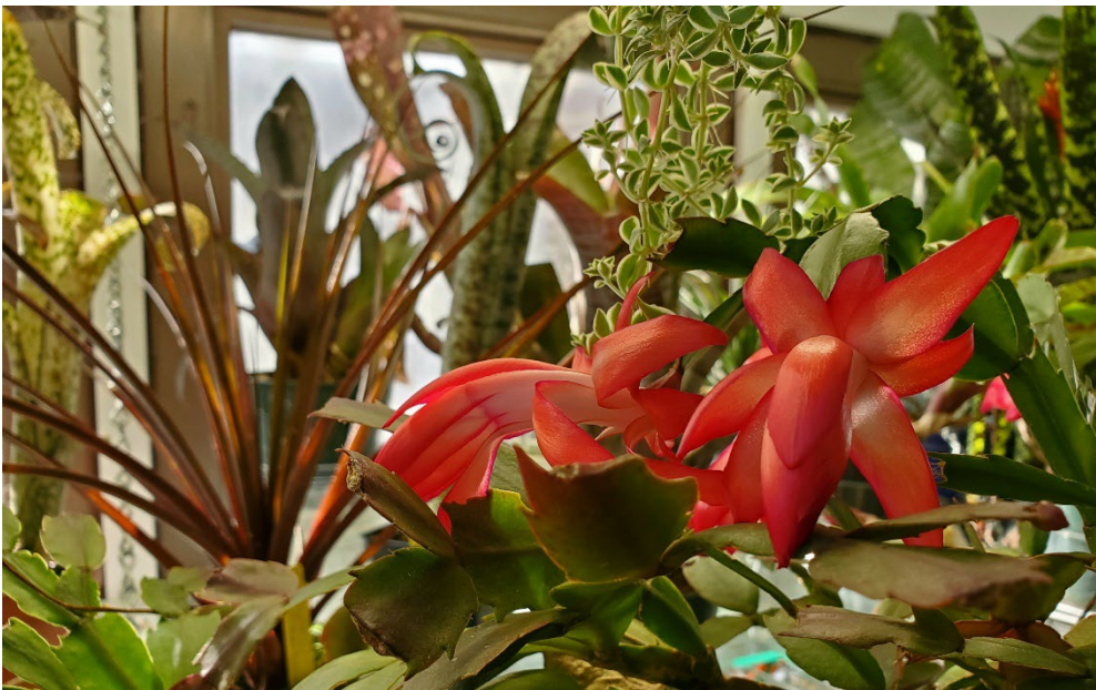
Mixed tropical plants in the sunroom. ( left ) Photo taken January 10, 2023 by Carol Kimbrough