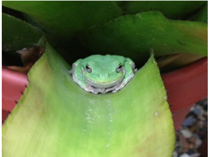
Eastern gray tree frogs love bromeliads! They were frequently sighted this summer by many of our members- (above) photo by Lynne Echlin

Aechmea ‘DelMar’ is a stunning hybrid with a long-lasting inflorescence. (right) photo by Lynne Echlin