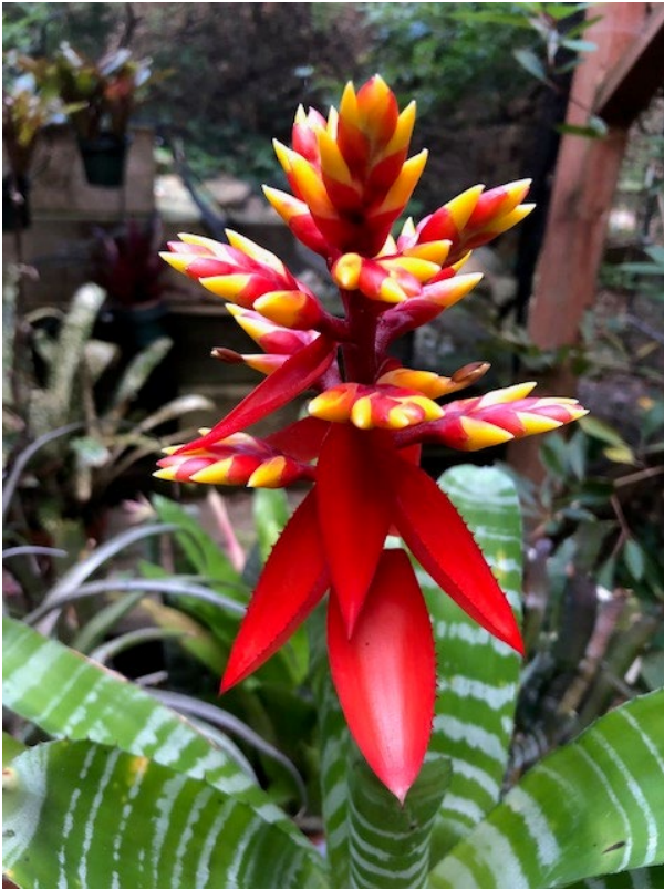
Aechmea chantinii - (left)