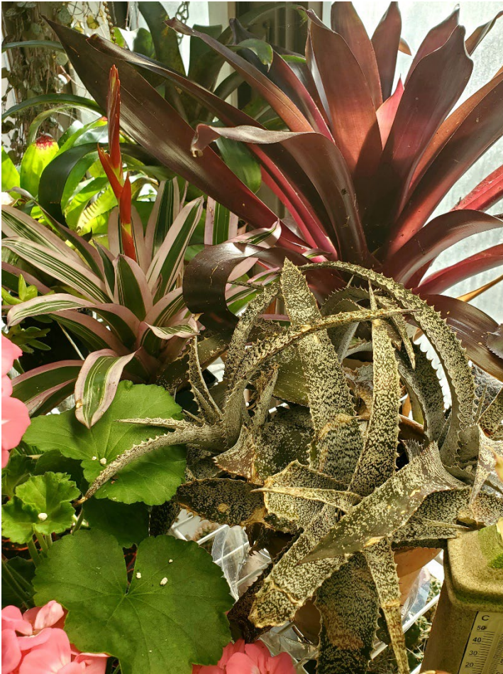
Billbergia 'Hallelujah' x 'Poquito Blanco' blooming in early December 2022 ( right )

A pleasant January morning in the Carol Kimbrough's sunroom ( left )