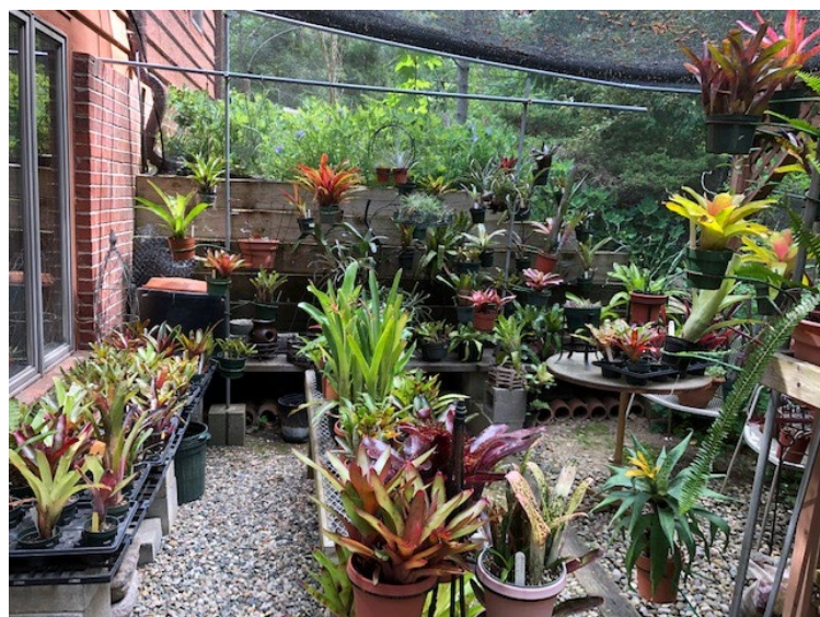
Lynne's shade garden retreat (below)